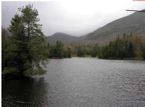
The view from Marcy Dam on a cloudy, rainswept day in May 2006

If you go about 1 mile up the trail from Marcy Dam, you will notice a marked camping area to your left (uphill from the trail): look for a path going downhill to the area where there was formerly a lean-to, another nice place to stop and spend some time in the stream.